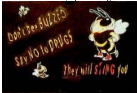
Shelby Herbkersman, 12-14, Hilton Head Island 10668 Alcohol category